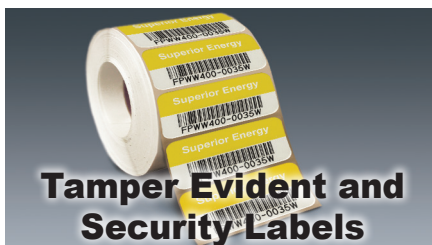
Tamper Evident and Security Labels