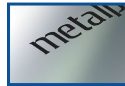
GLOSS highly reflective, mirror-like