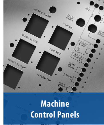
UID Labels / Nameplates