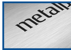
# 4 brushed to resemble a stainless steel finish