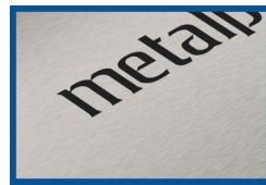
SATIN semi-gloss medium reflective material