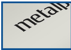
MATTE non-reflective with dull finish